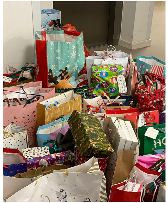
Inside Our Gift Room 2