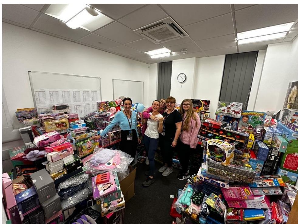
Inside Our Gift Room 1