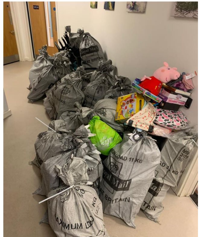
Donations of Gifts 2