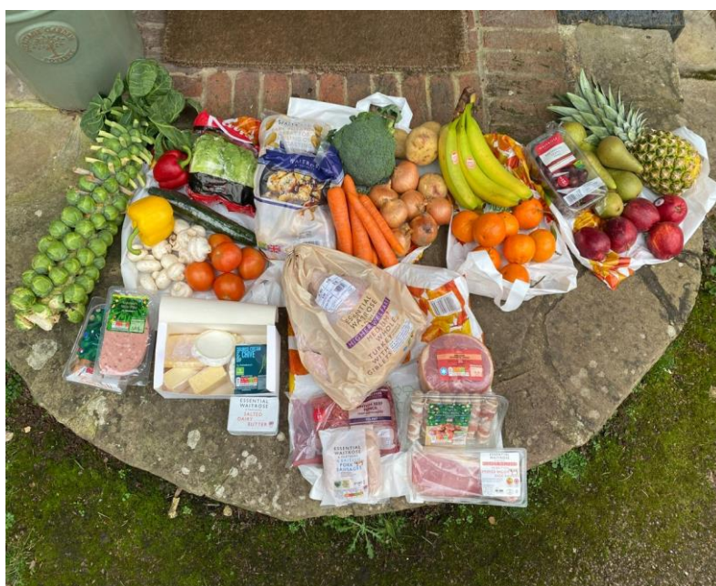
Contents of the Fresh Food Hamper