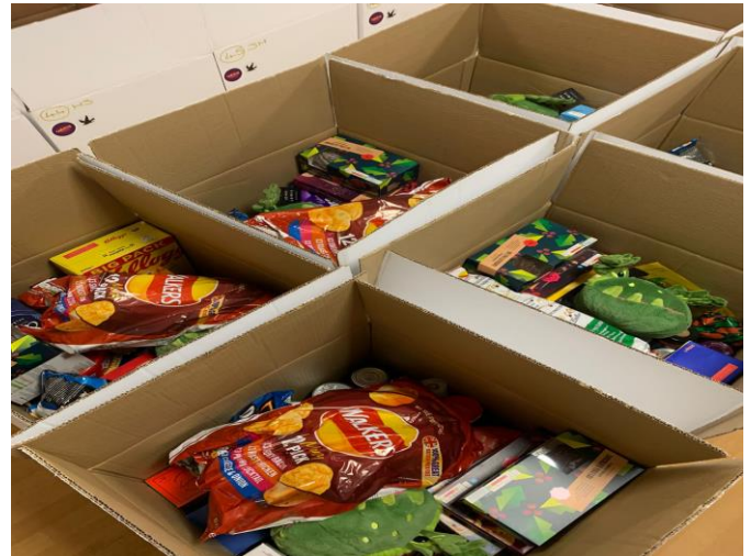
Inside the Boxes – Sweet and Savoury Treats and a Festive Toy