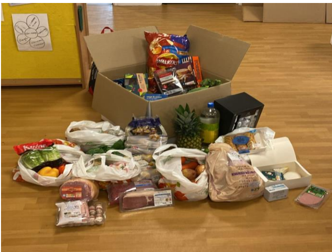
The Complete Hamper