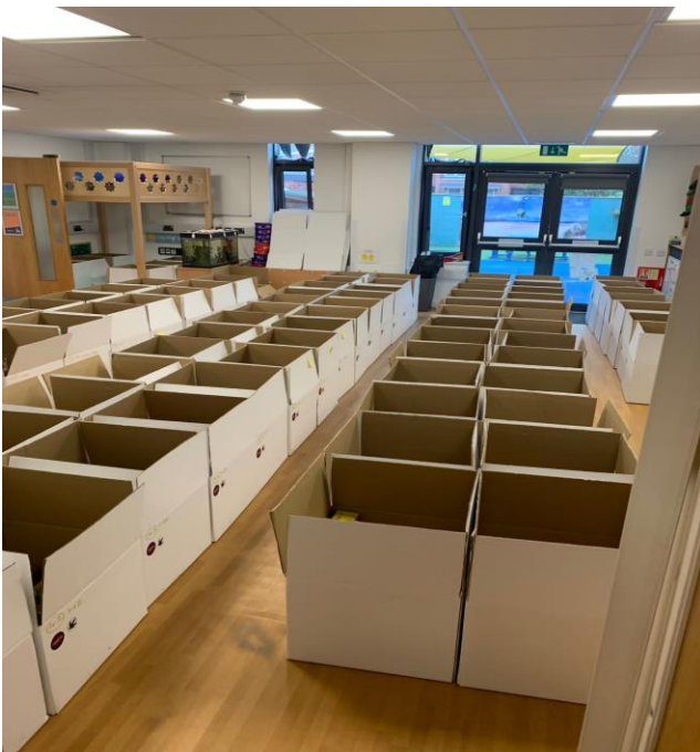
Preparing the Hampers 1