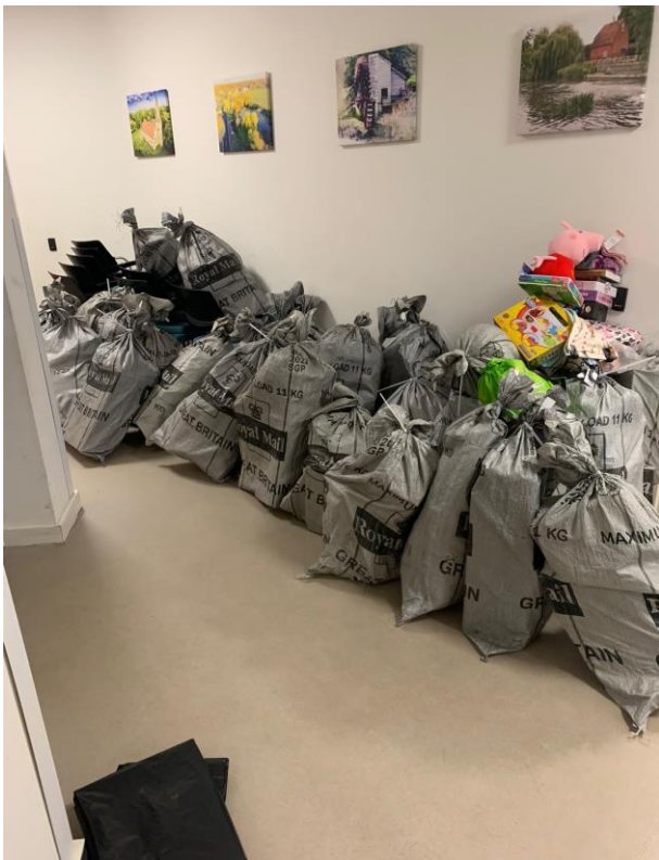
Donations of Gifts 1