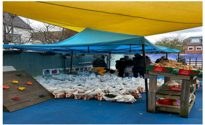
Preparing the Fresh Food 2