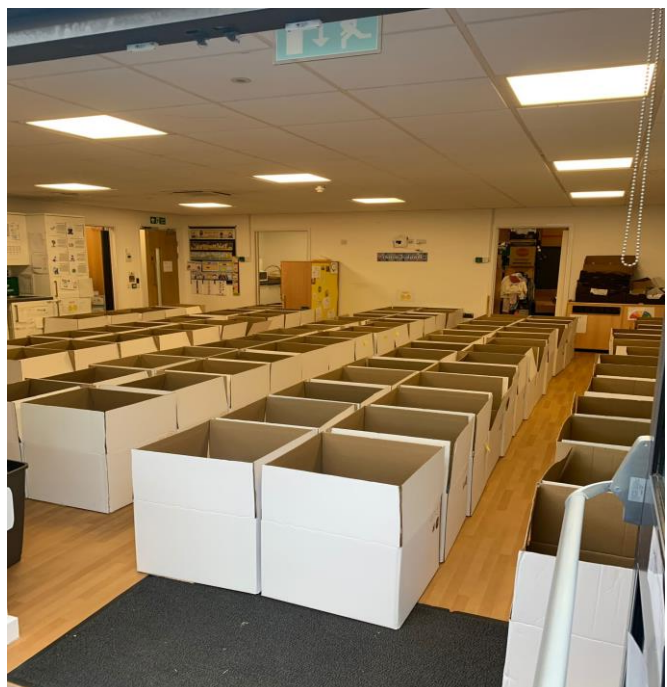
Preparing the Hampers 2