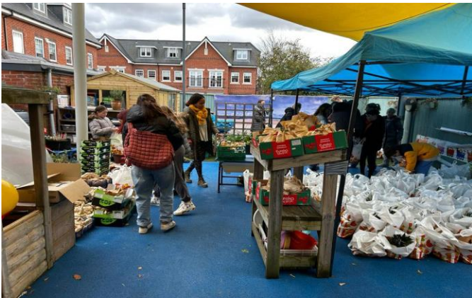
Preparing the Fresh Food 1