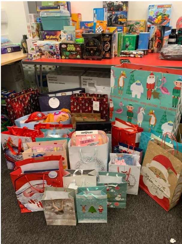
Inside Our Gift Room 3